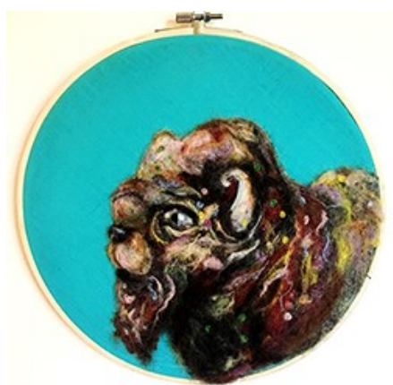
Where the Buffalo Roam