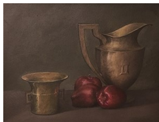
Brass with Apples