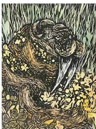
Sunny Botanical Wally