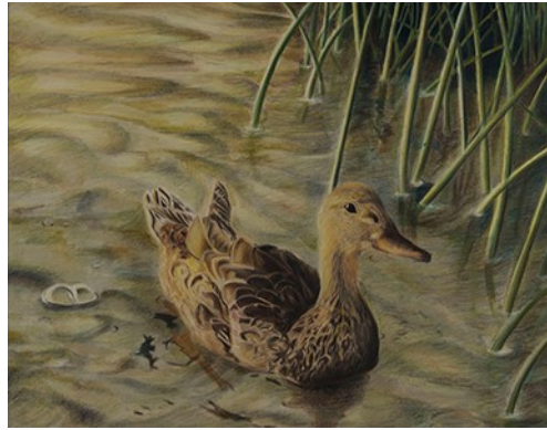
The Mottled Duck of Lake Leelanau