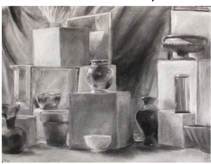
Still Life No. 8