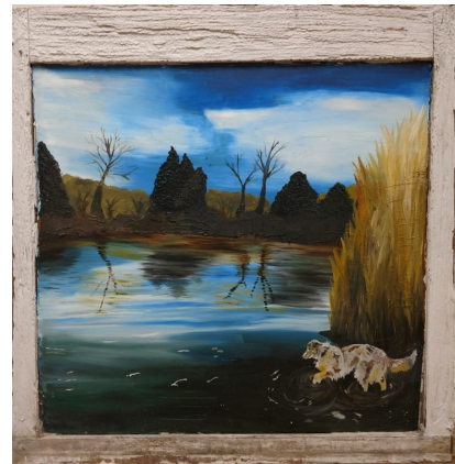
The Flocking Scarlett